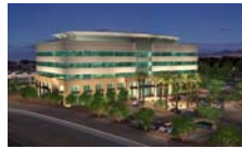
CENTENNIAL CORPORATE CENTER NORTH LAS VEGAS