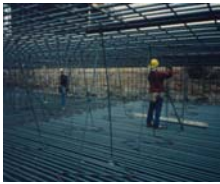
CONSTRUCTING THE FOUNDATION 12-FOOT THICK MAT