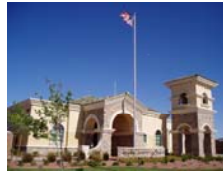
CLARK COUNTY FIRE STATION #11 LAS VEGAS