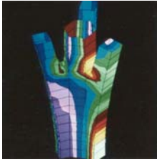
FINITE ELEMENT STRESS ANALYSIS SHOWN AT THE BASE OF THE POD