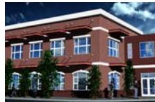
BRANDYWINE OFFICE BUILDING SUBURBAN WASHINGTON, DC