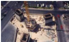
CONSTRUCTING THE TOWER LEGS USING JUMP FORMS & HIGH STRENGTH CONCRETE