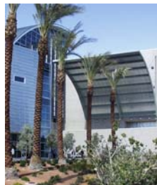
LIED LIBRARY UNLV | LAS VEGAS