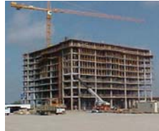
RENAISSANCE HOTEL & CONVENTION TULSA