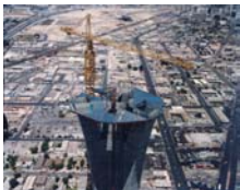
CONSTRUCTING THE POD 12-STORY STEEL MOMENT FRAMES