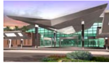
CONSOLIDATED CAR RENTAL FACILITY MCCARRAN INT'L AIRPORT | LAS VEGAS